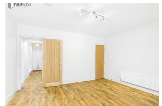
FLAT A, OVAL ROAD, CROYDON

We are pleased to present this stylishly refurbished two-bedroom split-level maisonette, ideally located approximately a five-minute walk from East Croydon Station, offering excellent connections to London, Gatwick, and the South Coast. Available immediately for a long-term let.